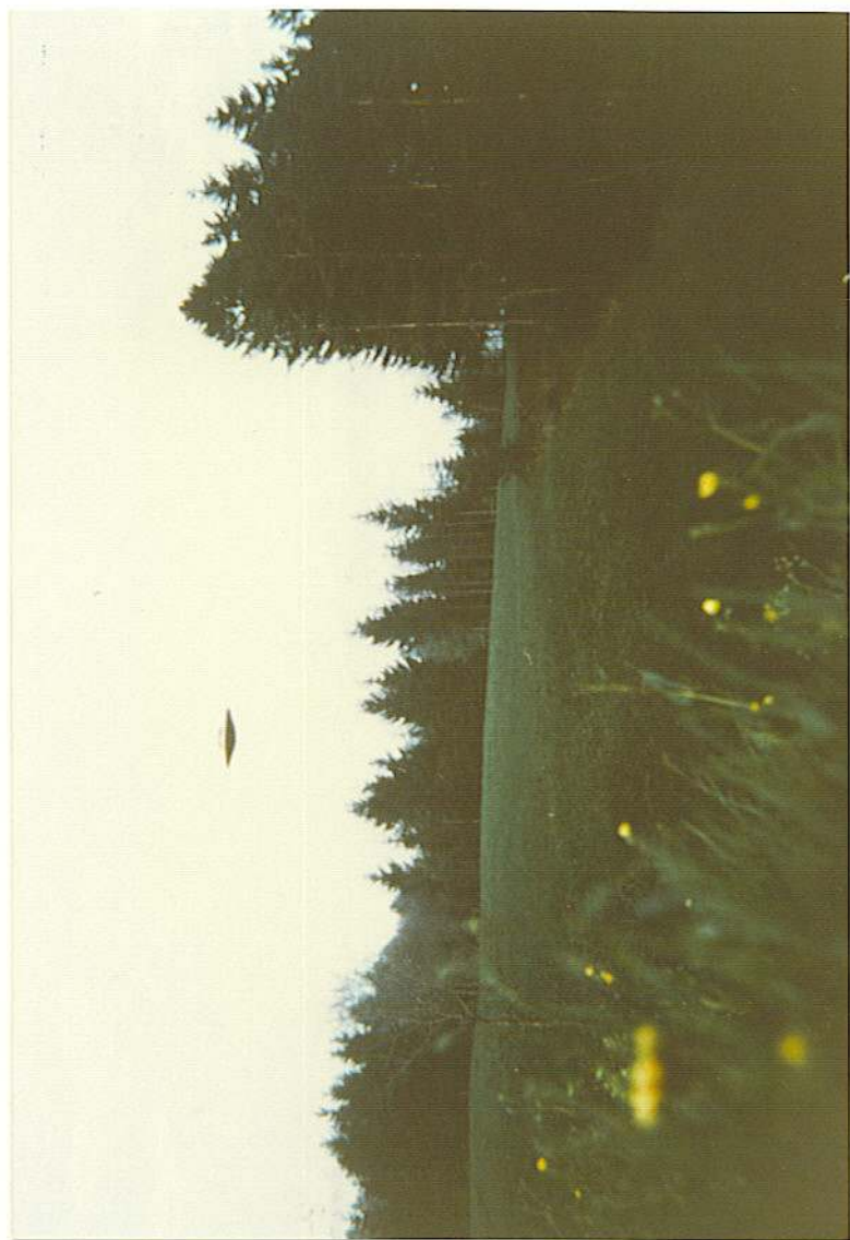
Ober-Sadelegg, Switzerland, 8 March 1975, 17:20. The beautiful ship moved away and toward the left as it continued its wandering line of travel across the grassy meadow before it changed direction to the north.