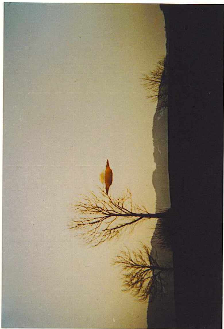
Hasenbol-Langenberg, Switzerland, 29 March 1976, 18:10. The big ship slows out over the valley and makes a carefully controlled approach to just beyond the larger of the bare-limbed trees in center foreground.